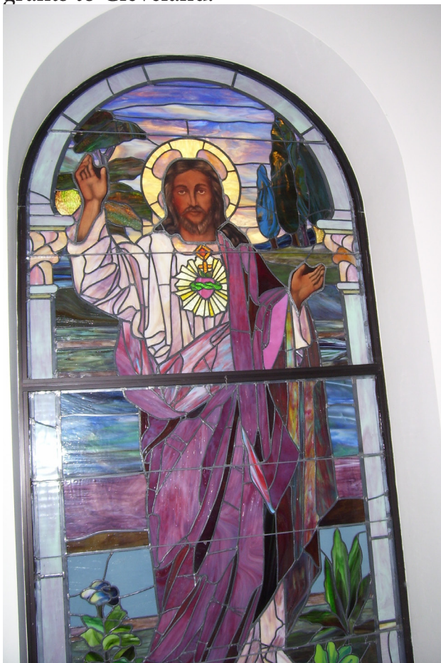
Sacred Heart of Jesus window at left

The two smaller windows, which once were on either side of the main altar at St. Josaphat's, are also beautifully restored. The Sacred Heart of Jesus window is in the Sacred Heart Chapel at the Lake Road entrance, and the Blessed Mother window can be found in the Sacristy. The windows are closer to the floor and therefore each detail can be easily seen. They bring to this modern new church some of the beauty of the old churches as new generations can appreciate these beautiful sacred artifacts so generously donated by the early immigrants to Cleveland.