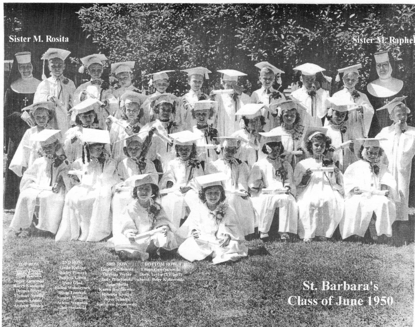
St. Barbara's Class of June 1950