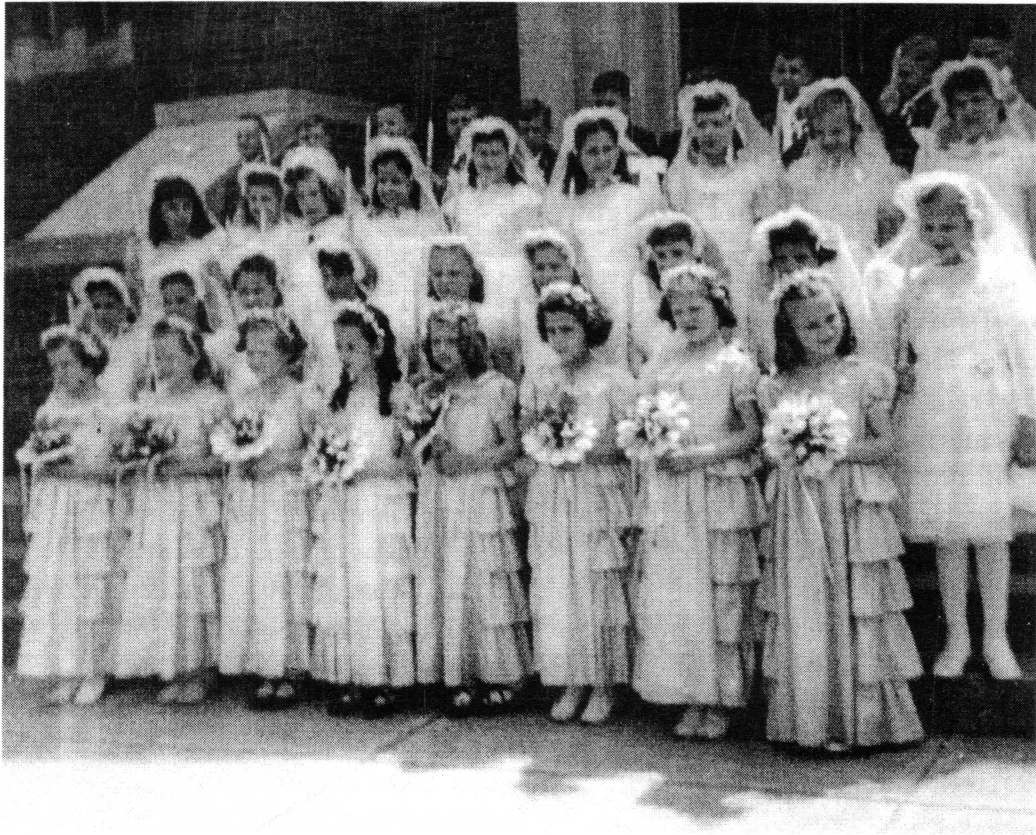
St. Barbara's Graduation Class of 1958