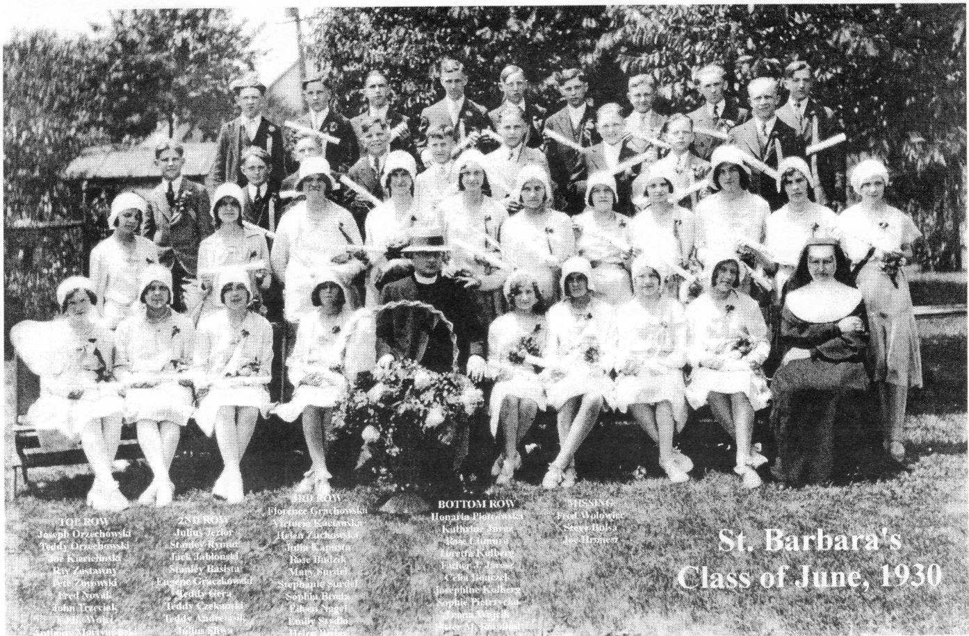
St. Barbara's Class of June, 1930